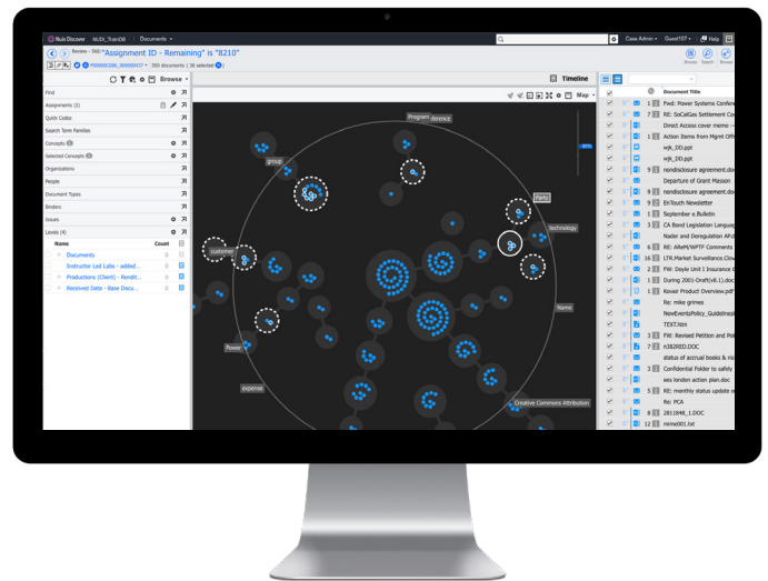
Nuix Discover's intuitive user interface allows reviewers to complete each task with fewer clicks.