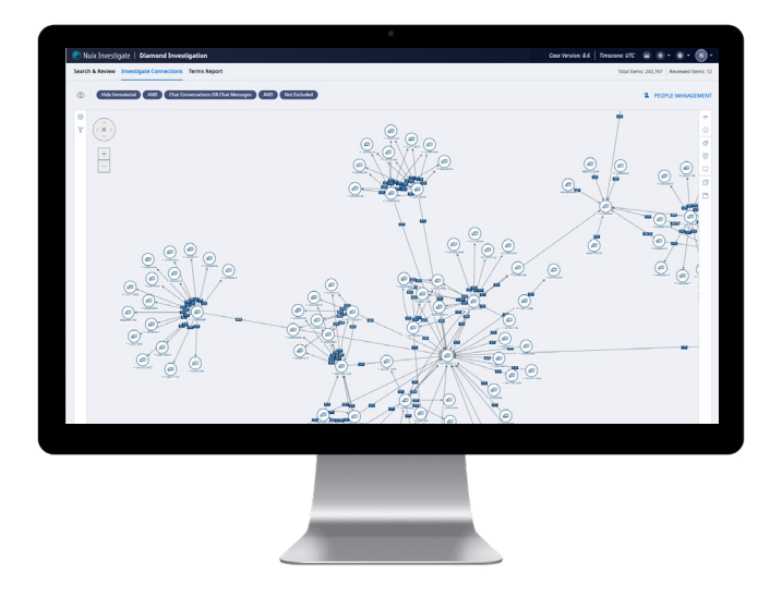
Quickly reveal the key players of the matter and what they're talking about in the communications canvas visualization.

investigators and other stakeholders to collaborate on case data and digital evidence. Protect sensitive information with role-based access to data sets and product features.