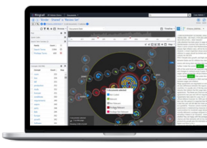
Nuix Discover's intuitive user interface allows reviewers to complete each task with fewer clicks.