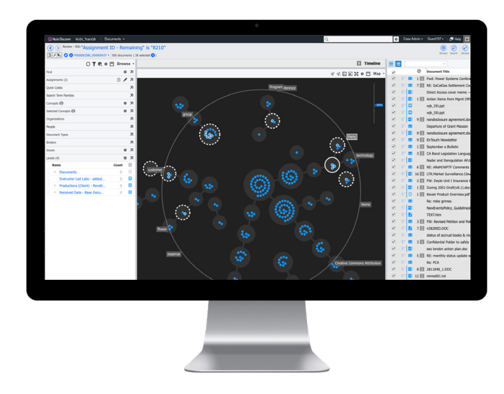
Nuix Discover's intuitive user interface allows reviewers to complete each task with fewer clicks.