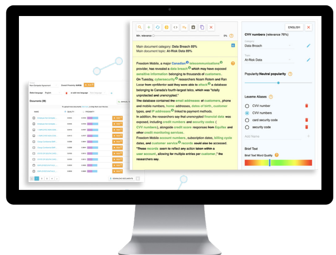
Nuix NLP allows knowledge workers to create and fine-tune terms, document types and topics.