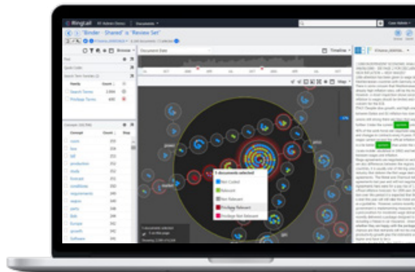
Nuix Discover's intuitive user interface allows reviewers to complete each task with fewer clicks.